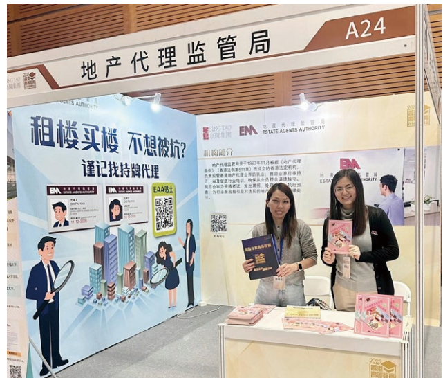
監管局於博覽會的展位。 EAA booth in the "GBA Higher Education Expo 2025".