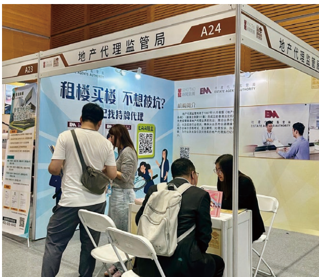
監管局人員解答訪客的疑問。 EAA staff answered the queries of the visitors.

In addition, EAA staff also introduced the roles and functions of the EAA. The initiative was further promoted through an on-site supplement and an online article published after the event, so that more members of the public will be informed of the relevant information.