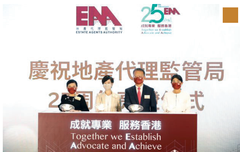
監管局慶祝成立25周年，舉辦了一系列主題為「成就專業 服務香港」的慶祝活動。 The EAA celebrated 25 th anniversary of its establishment and organised a series of celebration events in the theme of “Together we Establish, Advocate, and Achieve”.