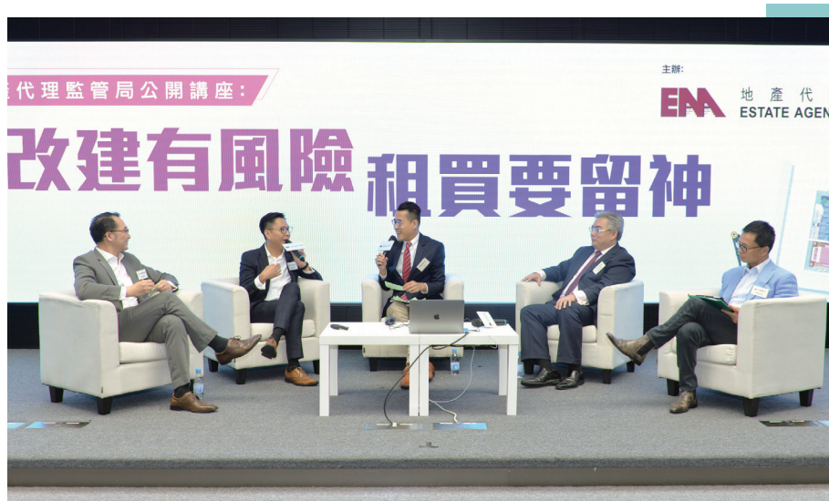
監管局於年內舉辦了兩場公開講座，以加強公眾對物業交易的知識。 Two public seminars were held during the year in order to enhance the public’s knowledge in property transactions.

On the other hand, two public seminars were held during the year in order to enhance the public’s knowledge in property transactions. In September 2019, a seminar titled “Be alert when renting or purchasing properties with alteration works” was held. Four speakers from different professions shared with an audience of around 150 their insight on the possible risks when renting or purchasing properties with alteration works. Owing to the spread of COVID-19 in the community in early 2020, the seminar held in March 2020 titled “Purchasing Non-local Properties Be SMART” was conducted online for the first time. The online seminar was broadcast through Facebook, which allowed the online audience to interact with the three speakers in real time. A positive response was received from the public. Over 3,000 views were recorded during the live broadcast of the seminar and the recap video was viewed 40,000 times in the week afterwards. Video highlights of the seminars were also uploaded to the EAA’s websites and YouTube channel for the public’s viewing.