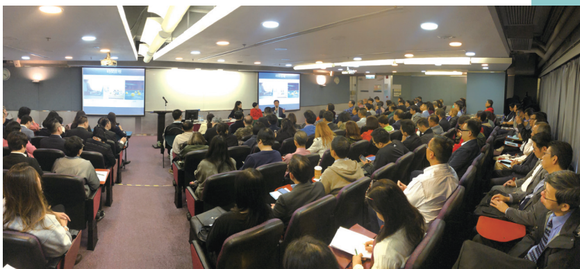
舉辦題為「聽君一席話 • 勝讀十年書」的持續專業進修講座。 CPD seminar on “Top Tips by Elites” held.

To help licensees fully understand the legal and regulatory requirements in relation to anti-money laundering (“AML”) and counter-terrorist financing (“CTF”), 30 CPD activities on this subject were held by the EAA during the year and attracted 4,000 enrolments in total. As an expansion of AML/CTF outreach amongst licensees remains one of the EAA's priorities, CPD activities on AML/CTF will be regularly provided to licensees.