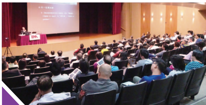
舉辦題為「物業交易 - 草擬物業租賃協議」的持續專業進修講座。

To facilitate licensees' learning, the EAA provides CPD activities in different forms, including face-to-face seminars and e-Learning programmes. To complement the EAA's CPD courses and activities, other educational institutions, trade associations and estate agency firms are encouraged to organise learning activities under the CPD Scheme. Licensees are also encouraged to undertake activities offered or accredited by the widely recognised professional associations of those professions or areas where the expertise of such fields are complementary to that of the estate agency trade.