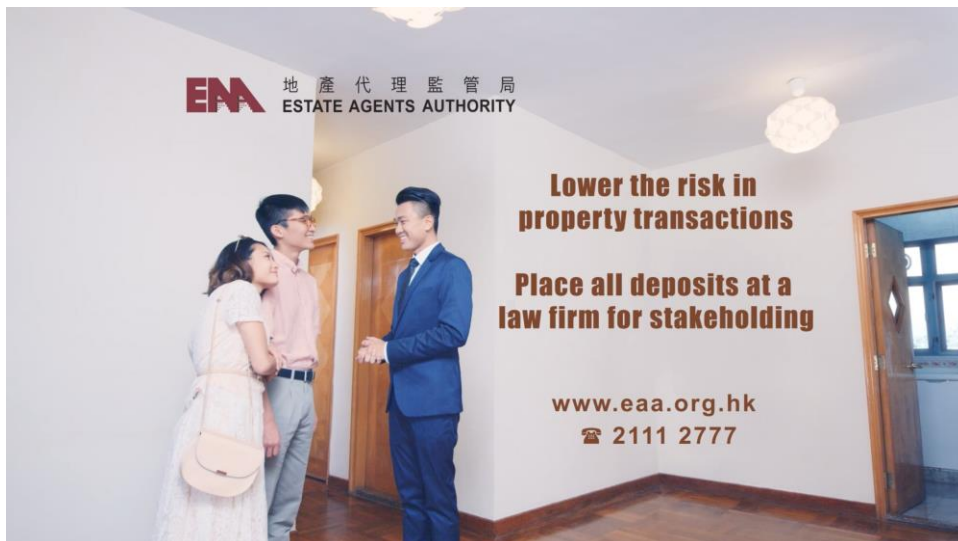
The new API reminds the public to place all deposits at a law firm for stakeholding during a property transaction