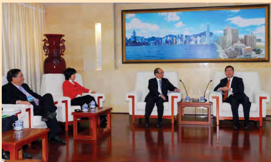
國務院港澳事務辦公室交流司向斌副司長（右一）與代表團交流意見。 Mr Xiang Bin (1st right), Deputy Director-General of the Department of Exchange and Cooperation, Hong Kong and Macao Affairs Office of the State Council, exchanges views with the delegation.

訪問團由監管局主席潘國濂先生率領，拜訪了國家住房和城鄉建設部、商務部、中共中央統戰部和國務院港澳事務辦公室，了解國情，並且介紹香港房地產中介服務業的規管和發展。訪問團也跟中國房地產估價師及房地產經紀人學會代表見面。