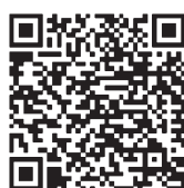
BD's website – Orders Search