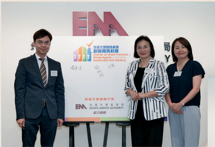
香港地產代理商總會代表出席簽署儀式。 The representatives of Hong Kong Real Estate Agencies General Association at the signing ceremony of the Charter.