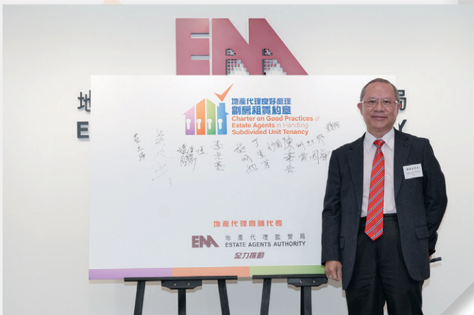
地產代理人員協會代表出席簽署儀式。 The representative of Property Agents Association at the signing ceremony of the Charter.