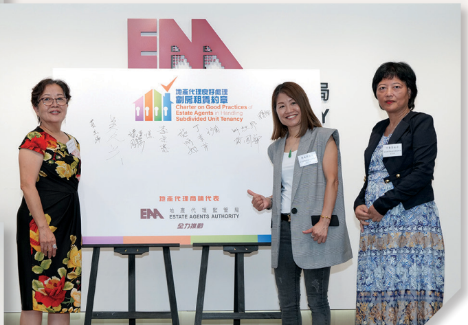
香港新界地產代理商聯會代表出席簽署儀式。 The representatives of H.K.N.T. Estate Agents & Merchants Association at the signing ceremony of the Charter.