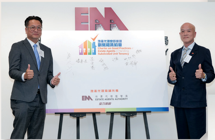
地產代理（從業員）總工會代表出席簽署儀式。 The representatives of Estate Agent Association at the signing ceremony of the Charter.